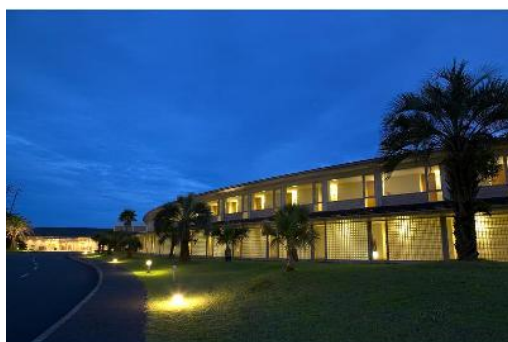
Kamakura Prince Hotel

http://www.princehotels.com/en/kamakura/