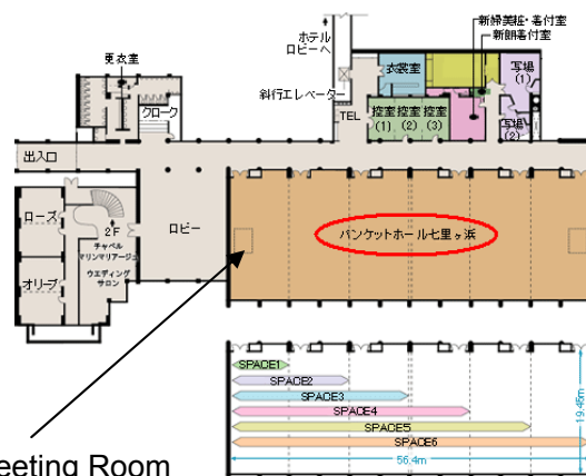
Meeting Room (Banquet Hall in the hotel)